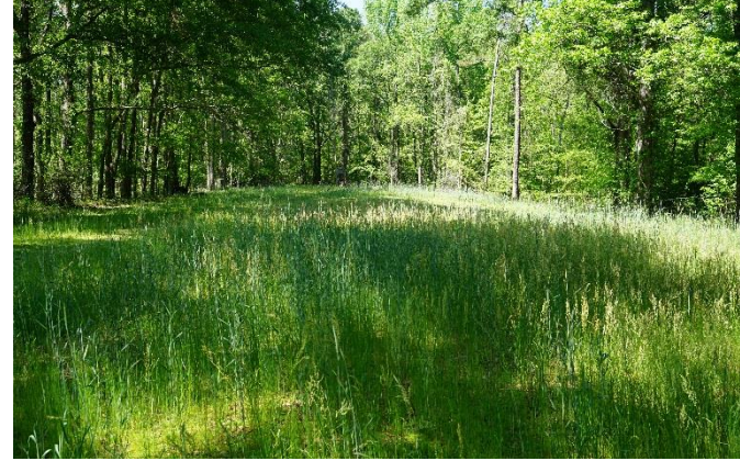
Tuesday, April 27, 2021